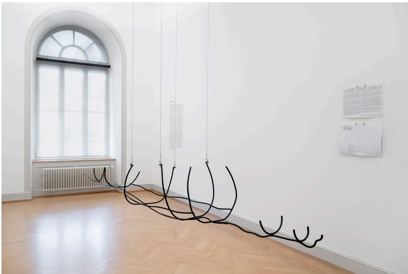
Installation views.