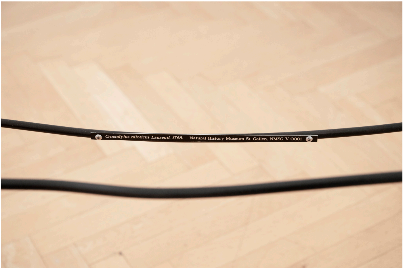
A Leak in the Ceiling (detail), 2023.

“My installation investigates one of the possible origins of the City of St. Gallen’s collections: the acquisition of a stuffed Nile crocodile in 1623, whose skin had been brought back from Egypt by Ulrich Krumm. This crocodile (inventory number NMSG V0001) was on display in the basement of this building for a long time, until the Naturmuseum moved. My intervention consists in recalling its trace, this time on the floor of the Kunstmuseum. This gesture serves as a reminder that, in 17th-century Europe, the boundaries between knowledge disciplines were still fluid.