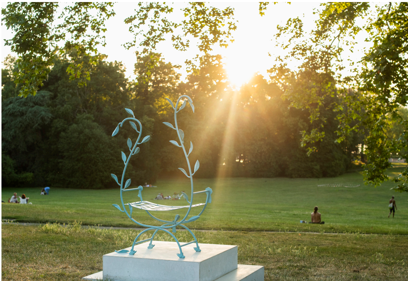
Exhibition view.

Powder coated bronze, steel & silver, concrete, ca. 160x50x75 cm