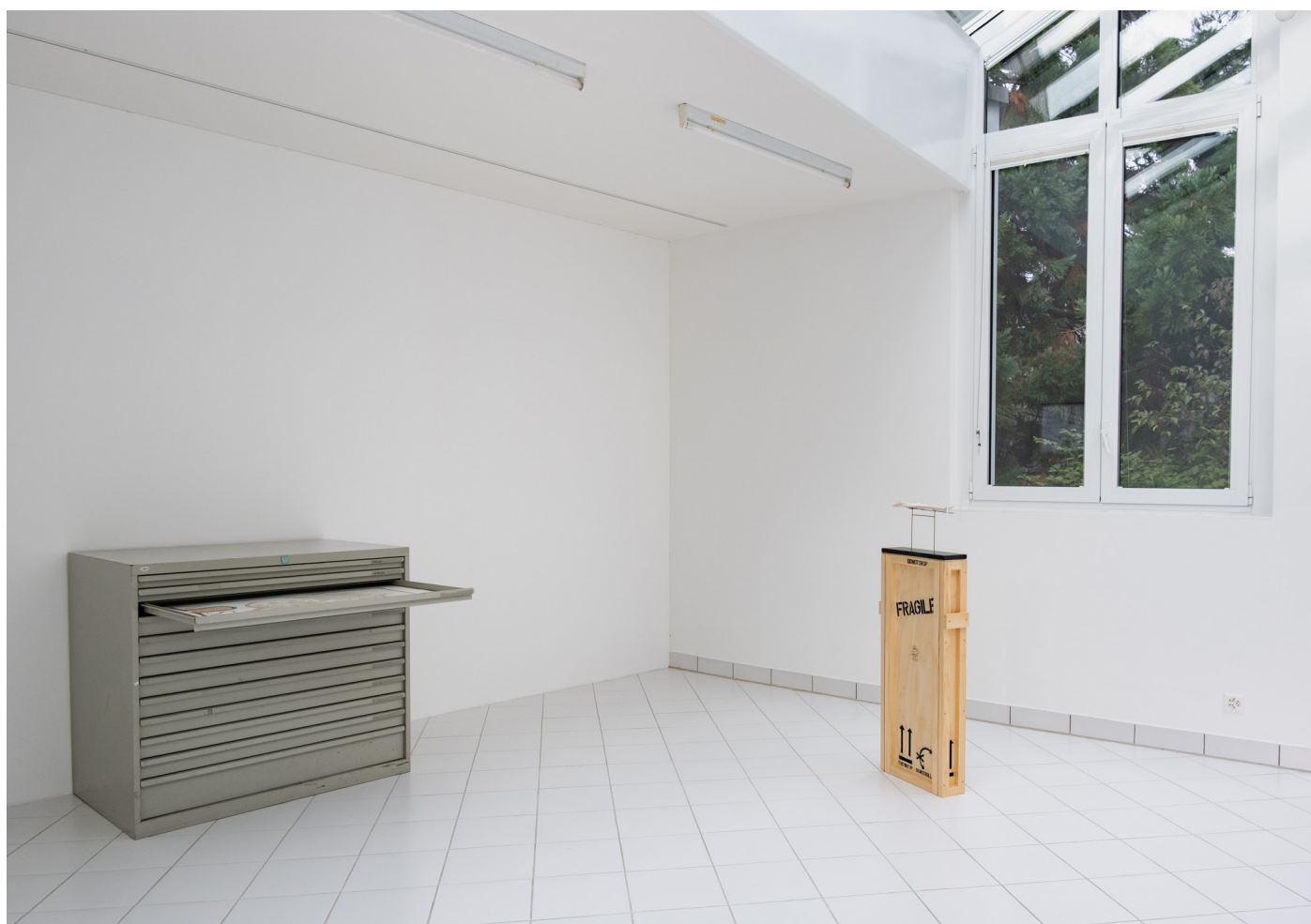
Exhibition views.