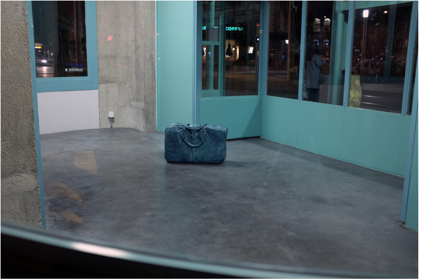
Exhibition view.

Papier mâché, styrofoam, acrylic paints, ca. 35x77x43 cm.