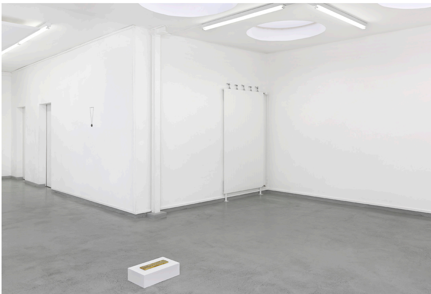
Exhibition views.