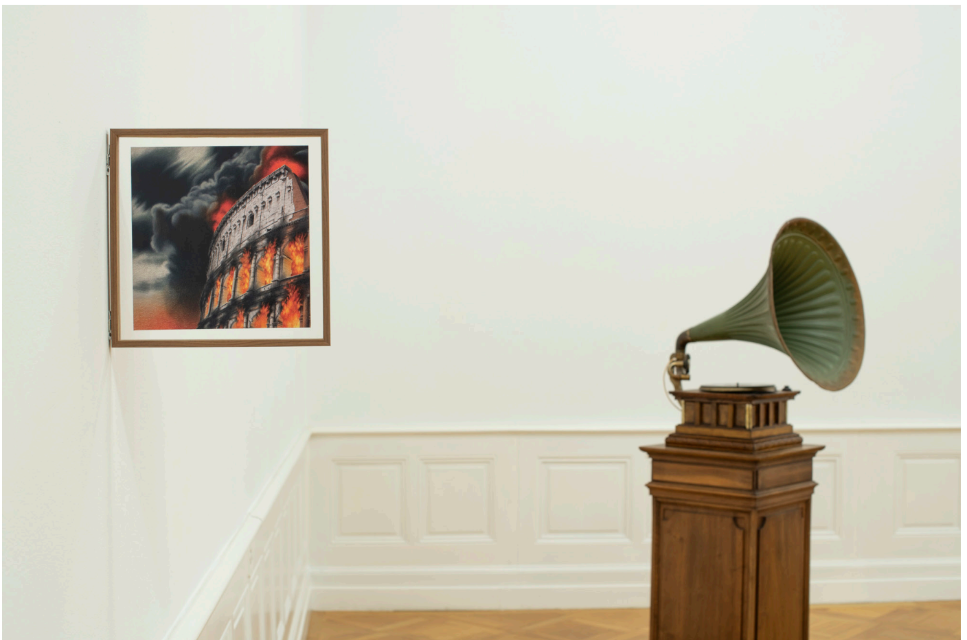
Nostalgia and Bombast , exhibition view & Nero Burning Rom , 2020.