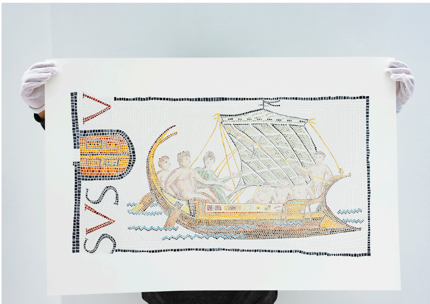
Hier à Sousse I, II & III, 2022.