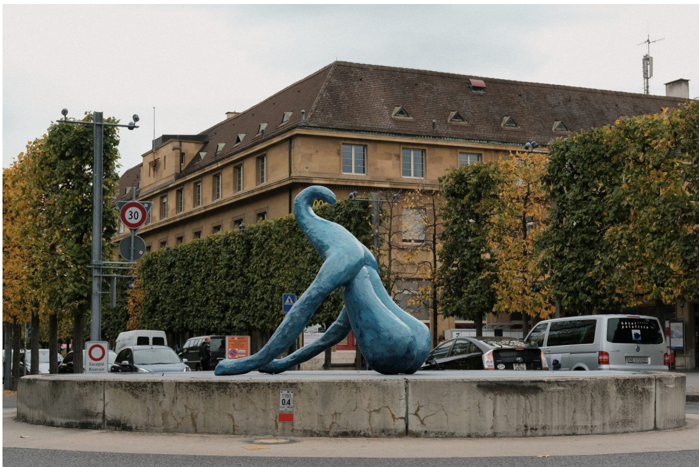
Instant Pleasure (Clitoris).