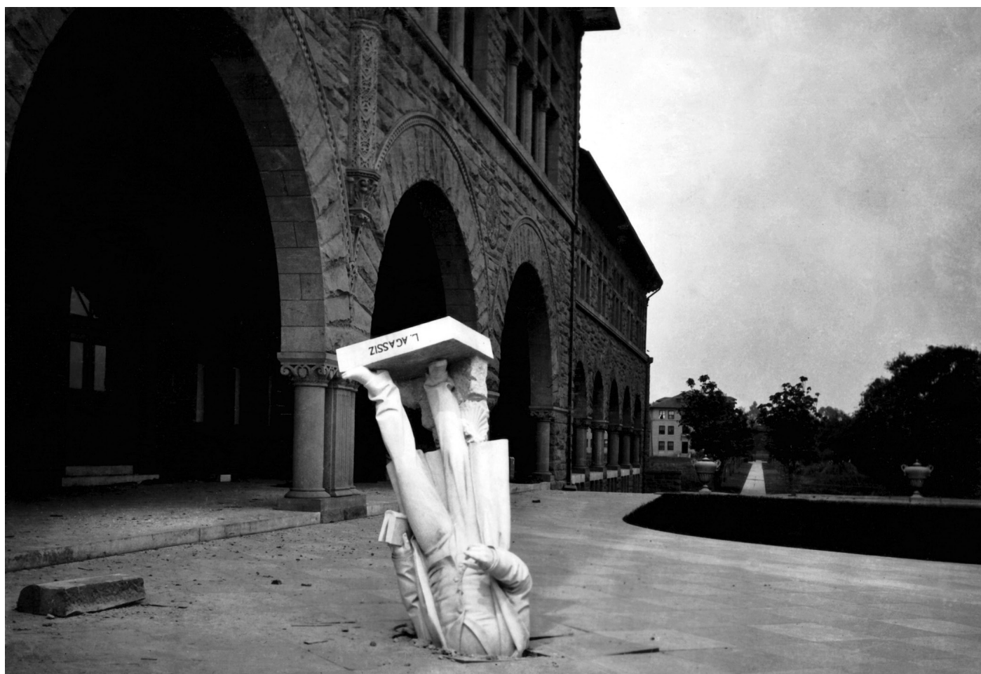
Photo: Sébastien Verdon & marble statue of Louis Agassiz, Stanford University, California, April 1906. Photo: Stanford libraries.