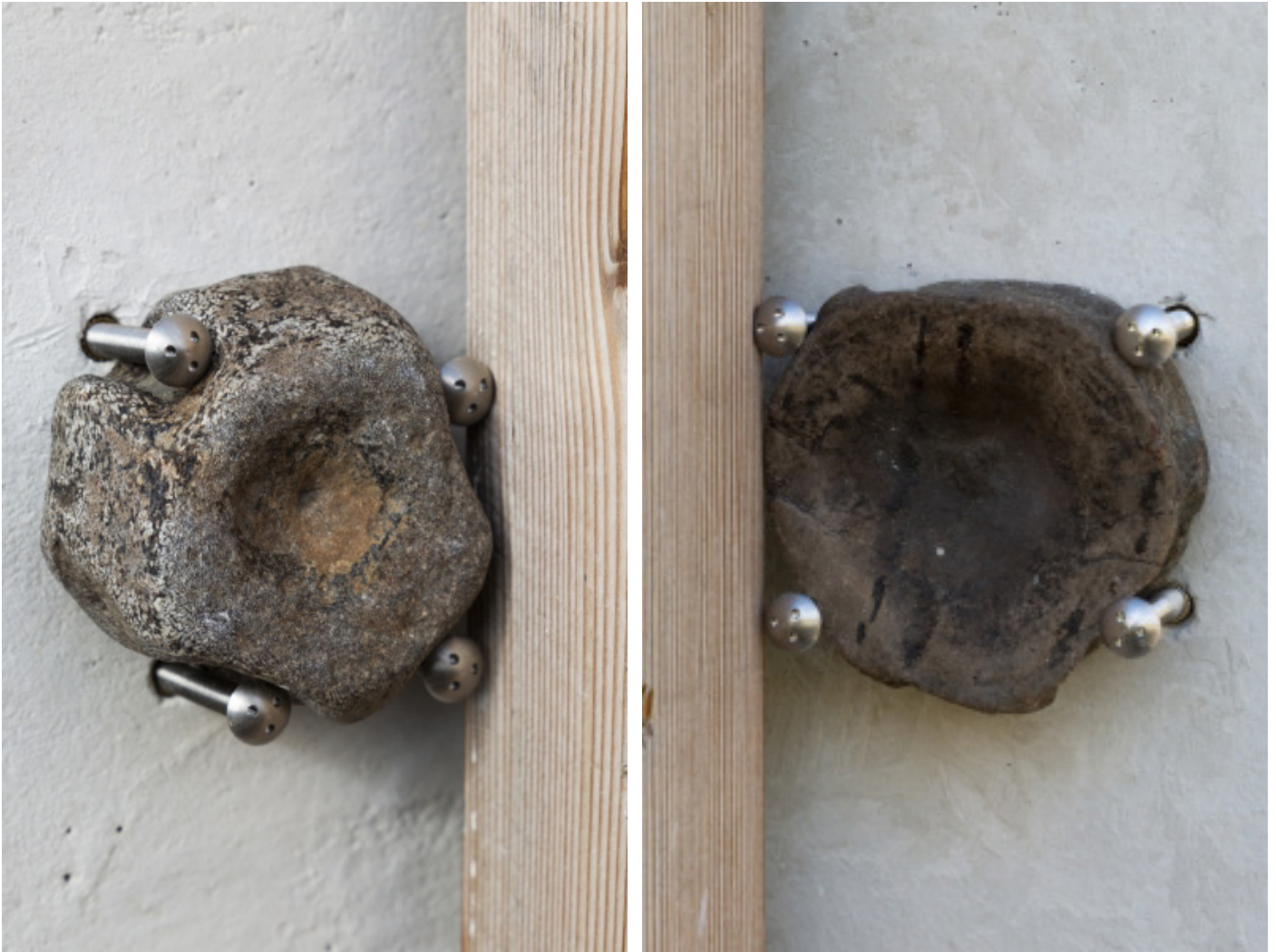
Natural History (1%) .

Fossilized vertebrae (plesiosaur & ichthyosaur).