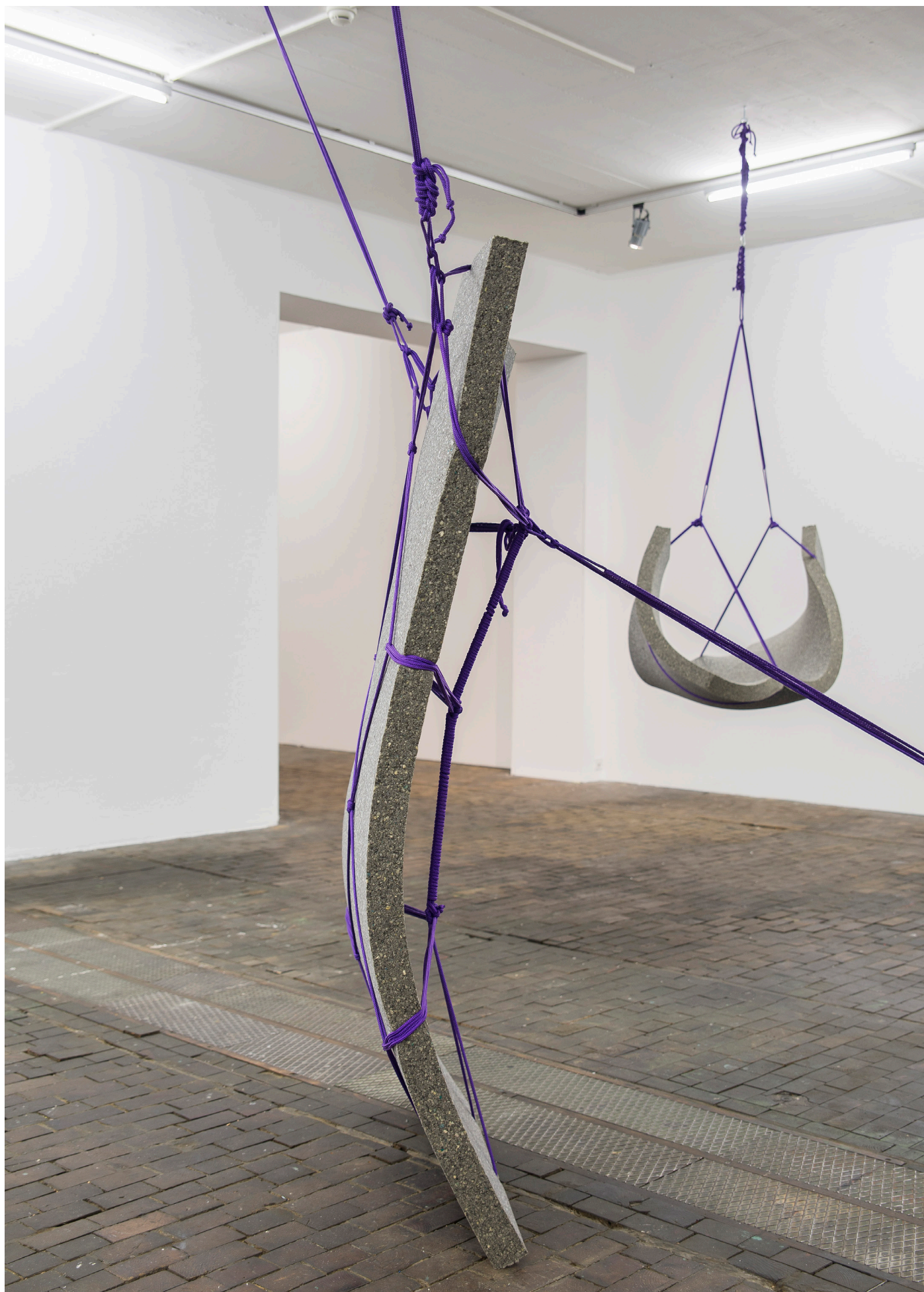
Verso Oltremare (Screwed and Chopped) .