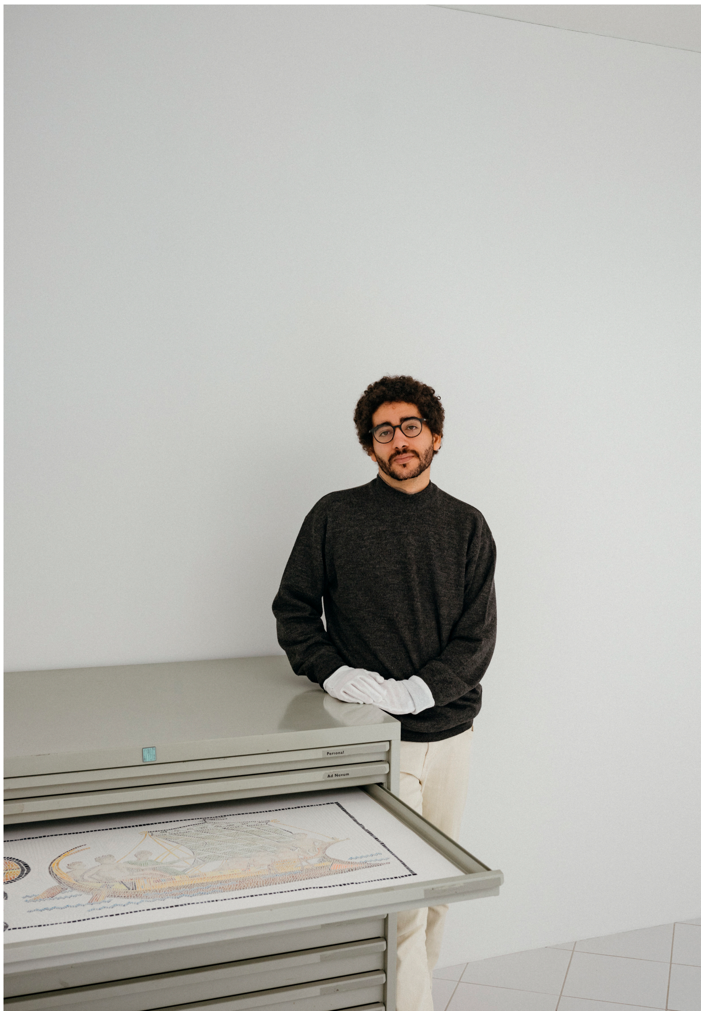
Portrait with Hier à Sousse III , 2022.