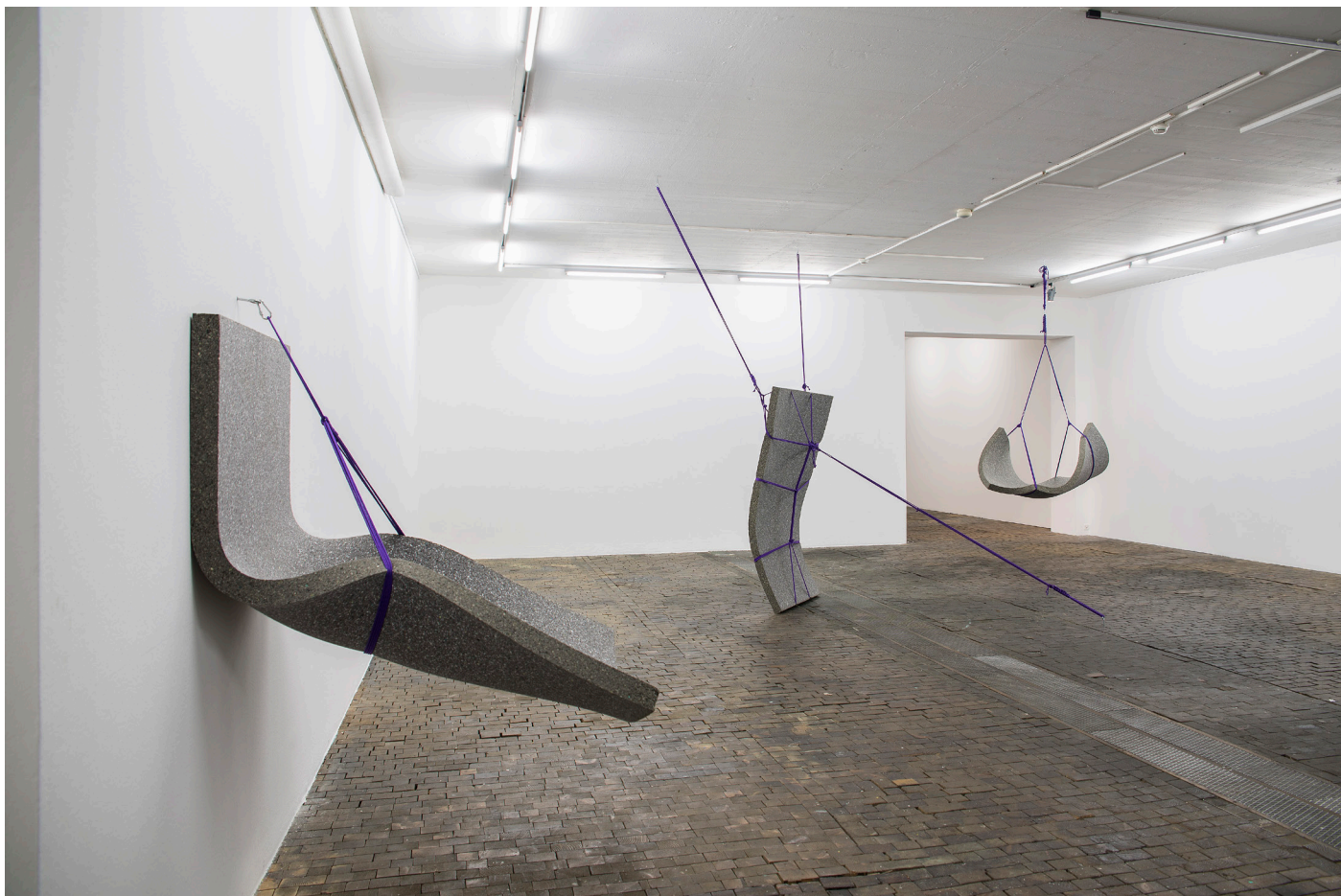
Exhibition view

In 2016, while a museum keeper at Mamco, I witnessed an accident involving Giovanni Anselmo's work Verso Oltremare (1984): a visitor caught her feet in the wire rope and the piece of granite shattered on her head. Fortunately, the person's life was saved, despite her injuries. The Centre d'art contemporain is an institution housed in the same building as the Mamco, and thus was an appropriate place for a distorted resurgence of my memory of the accident. Installation for the 2017 City of Geneva grants; winning project of the "Berthoud" prize.