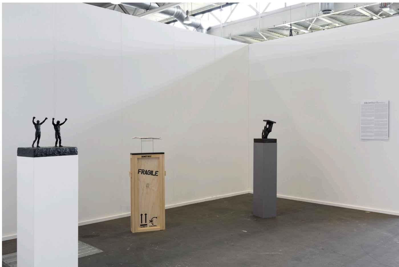
Footnote sculptures .