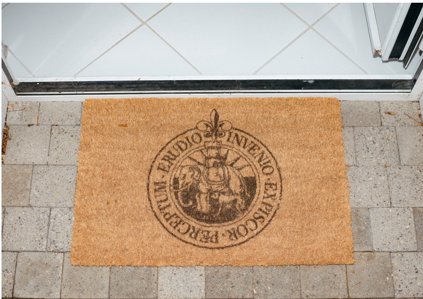
National Museum (in compliance with ITPA) , 2022.