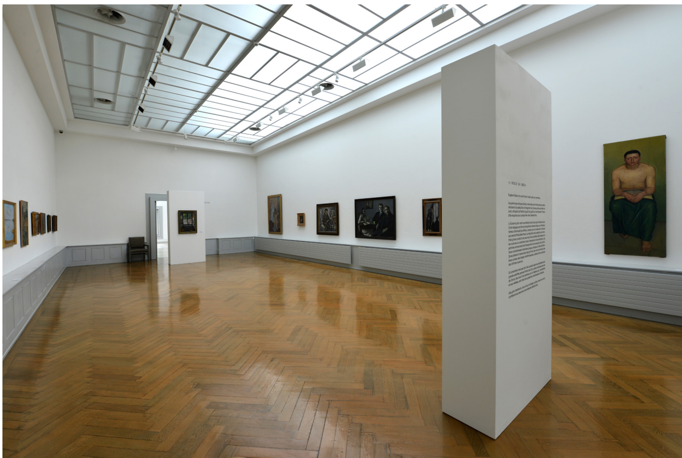
Exhibition view.

Laughing Stock consists of a carte blanche with the collections of the Musée des beaux-arts de La Chaux-de-Fonds occupying the second room of the second floor.