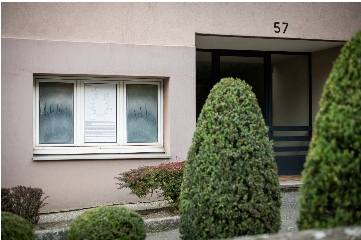
Exhibition views & developed cartel of the work (diagram) in front of my grandmother's house.