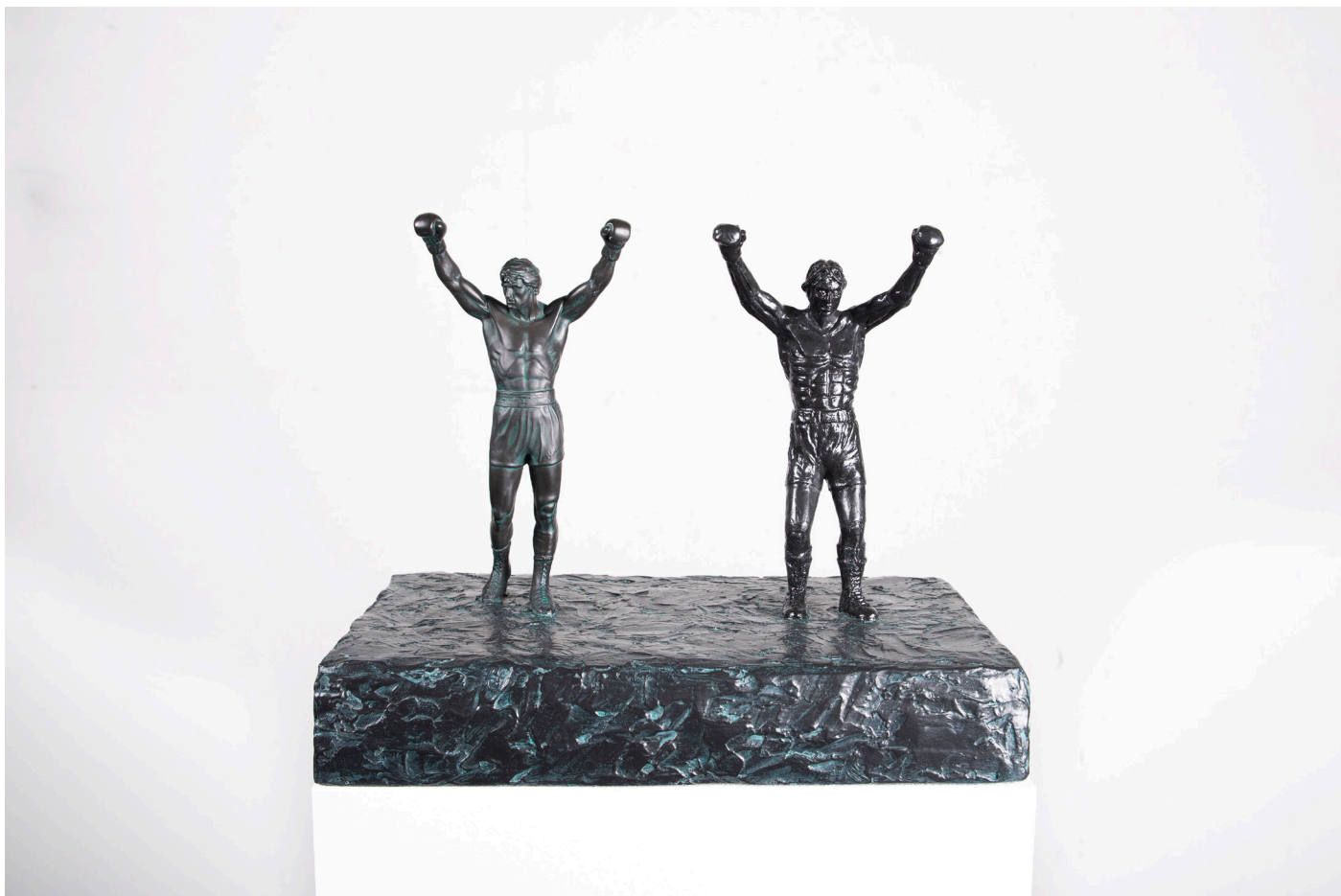
You're Gonna Love Picasso (After Schomberg and Staparac) , 2020.

PLVS VLTRA is an exhibition that examines objects that have a relationship to Greco-Roman antiquity and have trophy value: the famous Rocky statue , a film prop delegitimized by the Philadelphia Museum of Art, placed on the same level as its copy, a real public monument in the city of Žitište in Serbia [ You're Gonna Love Picasso (after Schomberg & Staparac) , 2020]; a series of melted down Spirit of Ecstasy , originally breathless sexist mascots of Rolls-Royce radiator caps [ After Ecstasy , 2018]; an Olympic medal commemorating the brief participation of Fine Arts in the Olympics [ At Least we still have the Venice Biennale , 2020]... and a brass plaque celebrating 10 years of a first love [ Mathias + Ella (10th Anniversary Remaster Edition) , 2020].