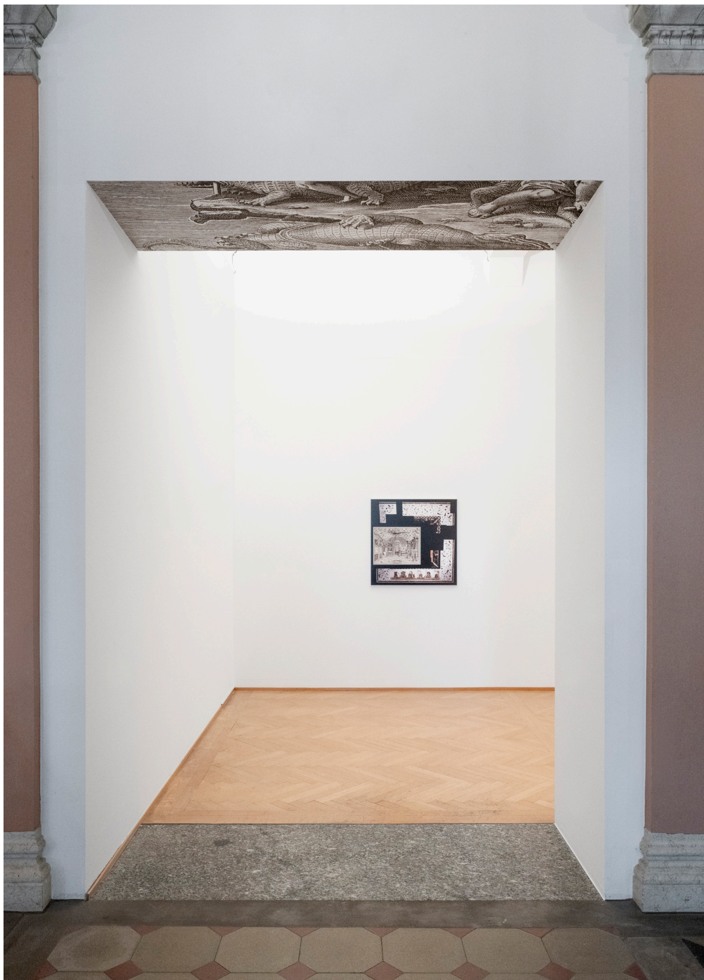
Installation view.