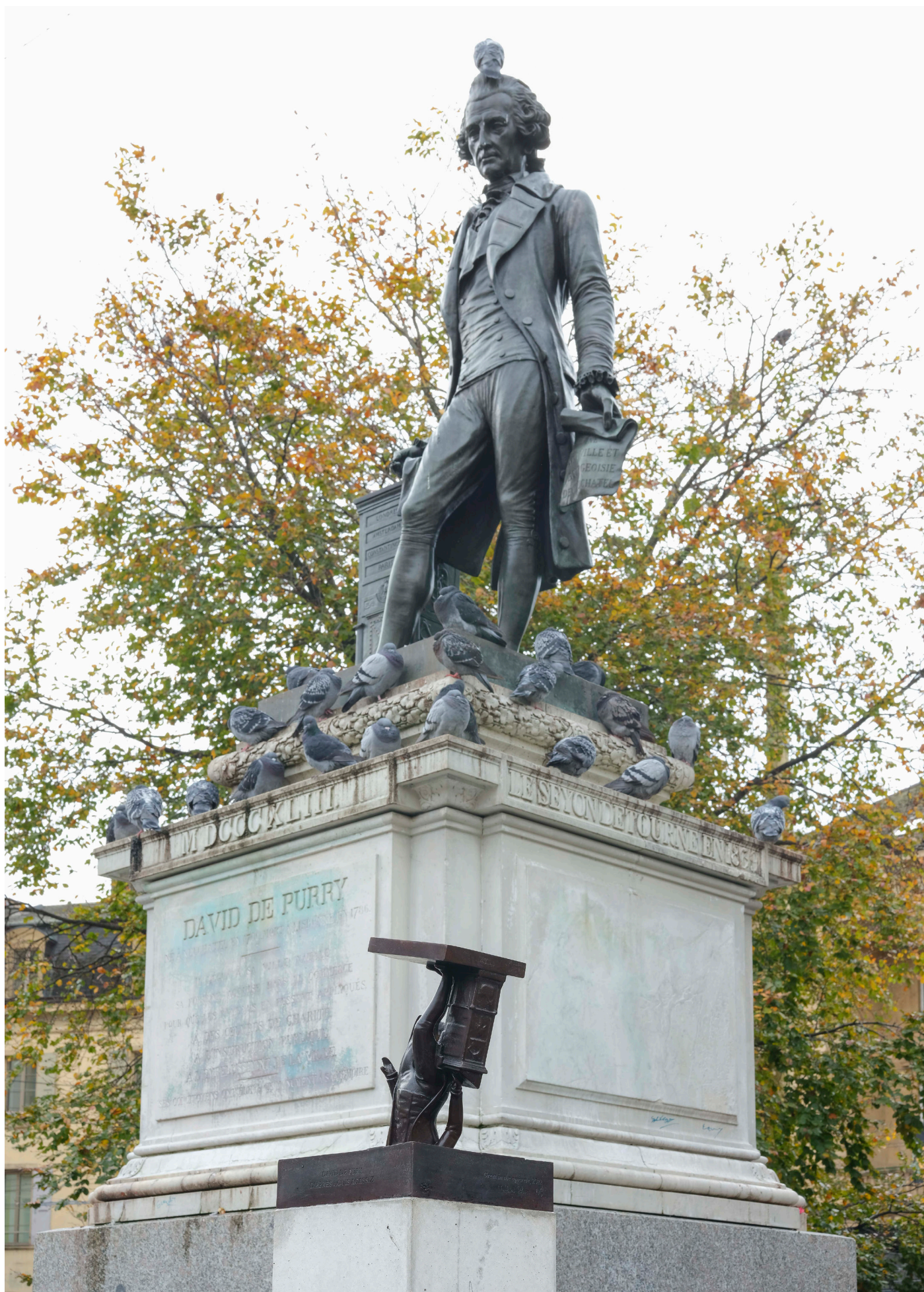
Great in the concrete .