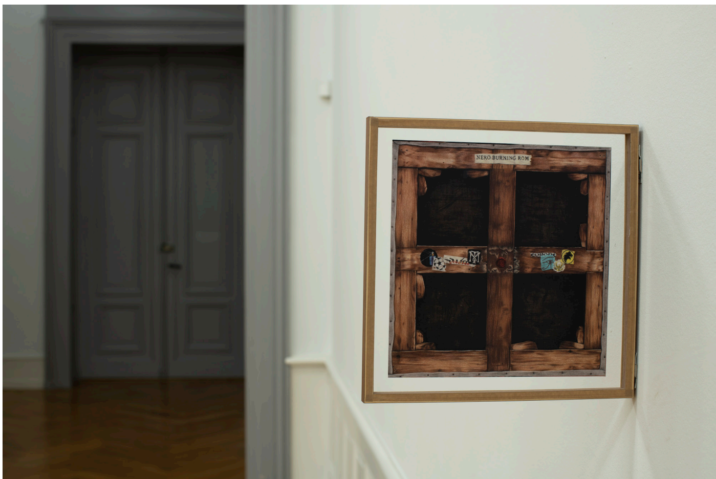
The World is Yours & Nero Burning Rom , 2020.