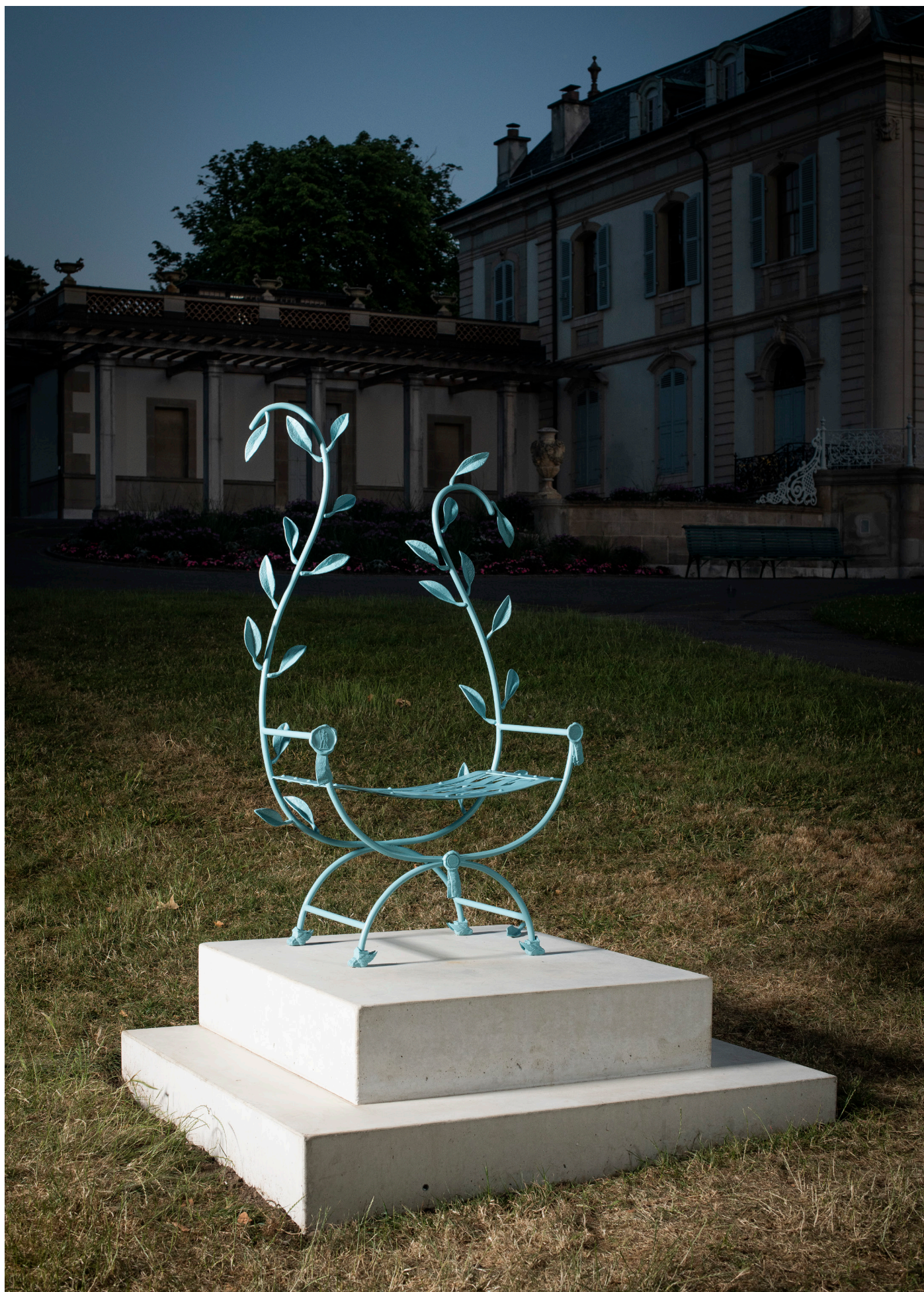
Exhibition view.