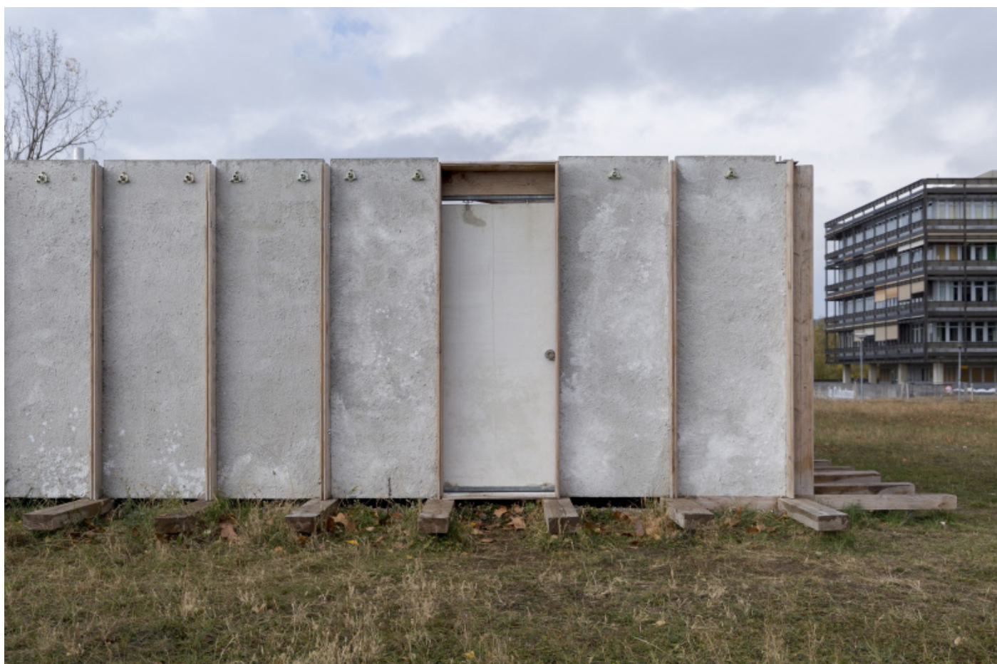
Exhibition views, photos: Constance Brosse.