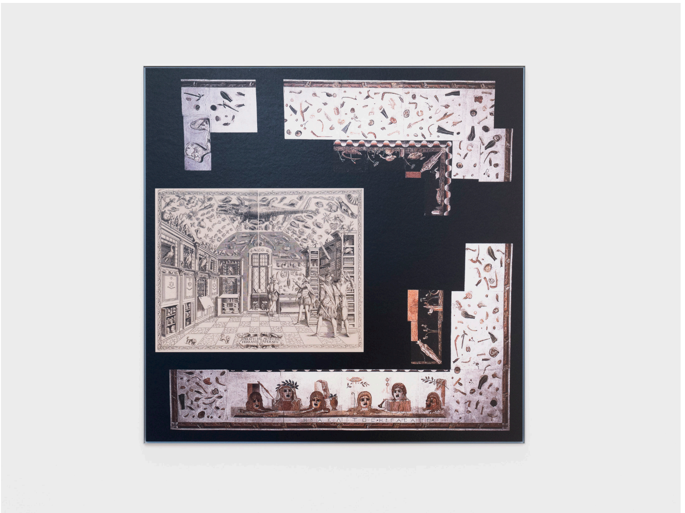
Goodnight Sweet Prince, 2023 & A Show of Wealth and Worldliness, 2023.