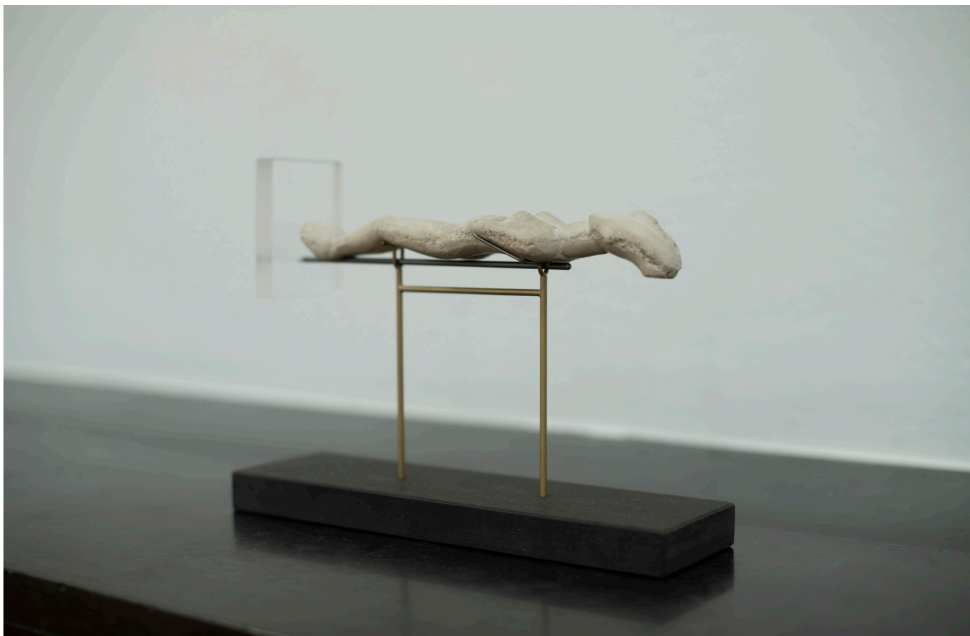
Still Standing (prototype) , 2020.

Nostalgia and Bombast is a duoshow with artist Marine Kaiser in the neo-renaissant palace of the Athénée, in Geneva.